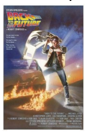
Jan 15 2:00 pm – Back to the Future

A misunderstood boy takes on ghosts, zombies and grown-ups to save his town from a centuries-old curse.