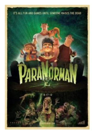
Jan. 8 2:00 pm - ParaNorman PG 92 minutes

A misunderstood boy takes on ghosts, zombies and grown-ups to save his town from a centuries-old curse.