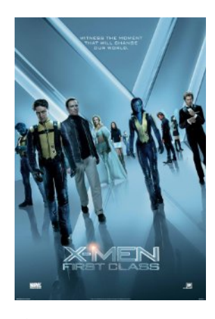
Jan. 29 2:00 pm X-men First Class

A US West Coast teen lifestyle parody centered around Cher, a popular high school girl who spends her days playing match-maker, helping her friends with fashion choices, and looking for a boyfriend.